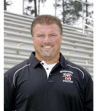
Outstanding Preceptor Award

Trainers who are successful clinical experts in the field.